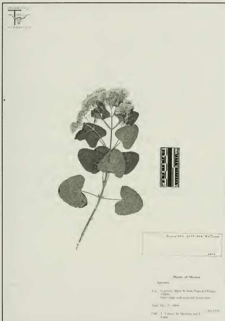
Fig. 7. Holotype of Ageratina yaharana .